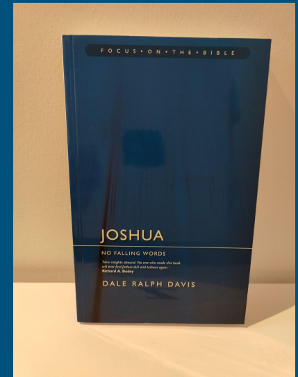
Joshua: No Falling Words